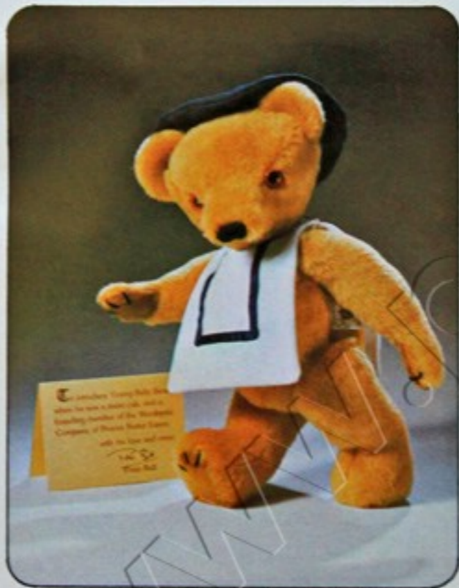
Young Bully Model 5027 He is 12" tall and wears the robes of the Worshipful Company of Peanut Butter Eaters. Limited to 5000 worldwide.

Famous British character actor Peter Bull started it all in the late sixties when he compiled and wrote The Teddy Bear Book . He is now the recognised father of the teddy bear movement and we are privileged to be able to collaborate with him in creating Bully Bear.