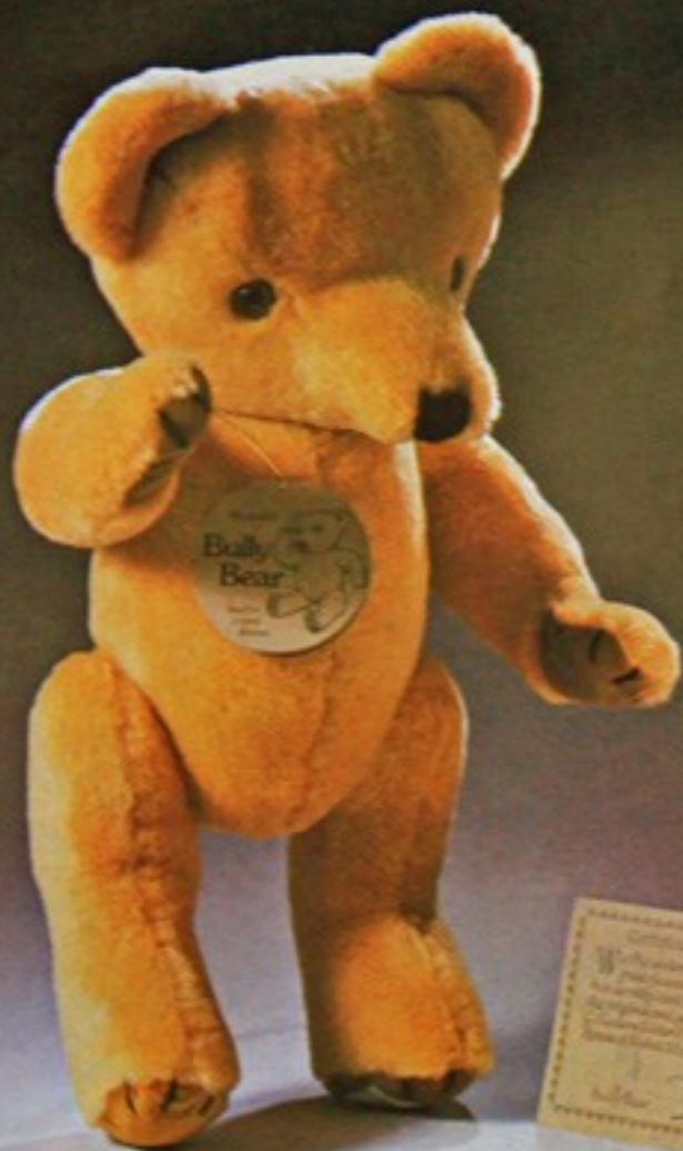
Bully Bear himself Model 5026