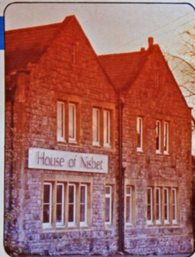
The Nisbet Workrooms at Dunster Park