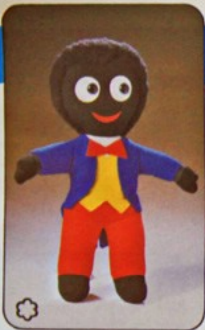
Left photo The Golly, Model 5022. A 19" golly in traditional dress. Right photo Bully Bear Storybooks Published by Bull & Irving, and every one a delight. Seven in the series.